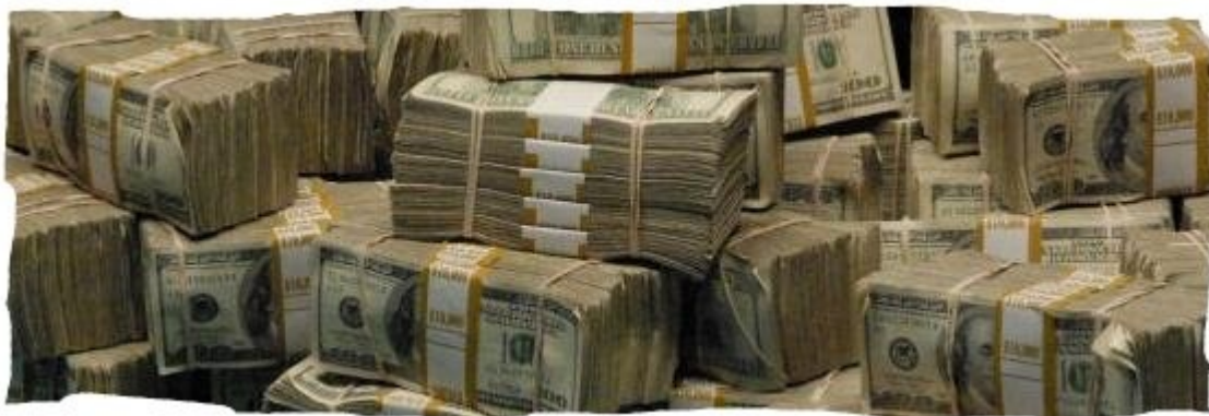
This can all be yours! Muahahaha.....

Now on to the really interesting stuff....making money with your website. Even if your intention is to maintain the site for personal reasons, you could still do a little light advertising. PPV adverts pay you when your page is viewed, so that might be an option. Read on for a quick breakdown of the most popular monetizing methods.